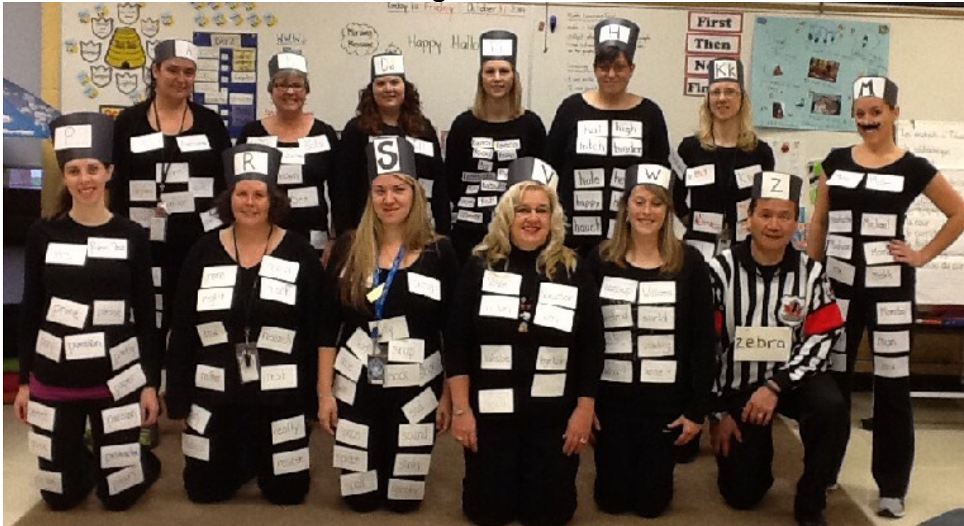
HALLOWEEN FUN—PIONEER PARK STAFF WORD WALL